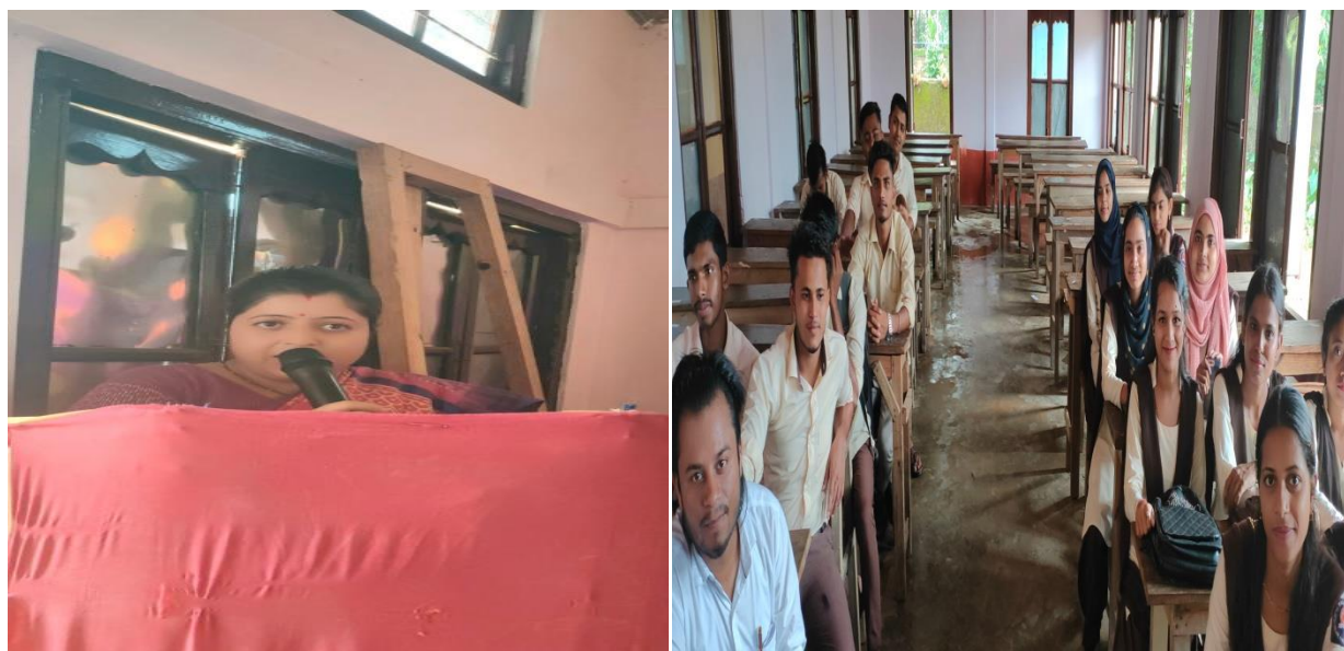
Departmental seminar on Research Methodology

Objective: To understand the basic concept of research methodology and its importance in further research.